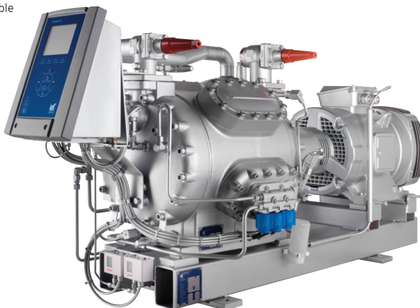
CMO 24 reciprocating compressor unit with Unisab III systems controller

Six different models are available to provide swept volumes of between 116 and 273 m 3 /h at 1800 rpm.